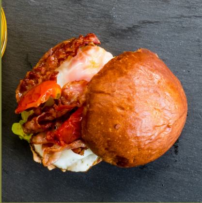
Bacon Bap serves 1 | FF

Grill 2 slices of lean bacon and fill a 60g wholemeal roll. Top with a sliced tomato and a tbsp. no added sugar ketchup or relish.